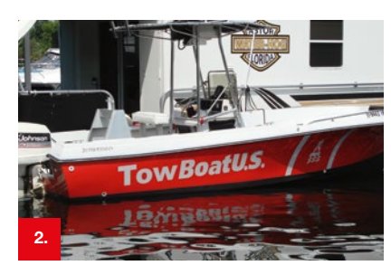
Example 2 ORACAL® 751C