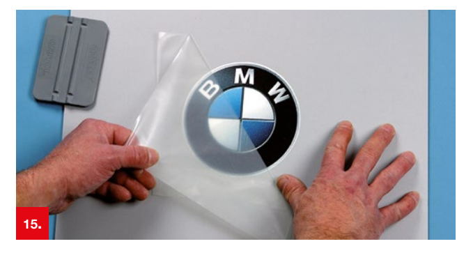
Example 15 ORATAPE® MT95

Reliable application tapes are required when computer-cut films are to be professionally and quickly applied. ORAFOL has developed application materials for a great variety of demands and uses.