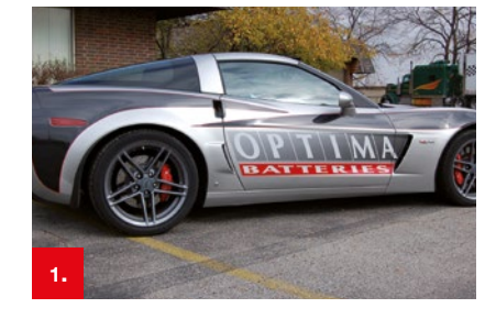
Example 1 ORACAL® 951

Designed for short and medium-term applications, this CAD/CAM vinyl can be used both indoors and outdoors. Its versatility and a range of 59 vivid colours with glossy finish and 56 colours in a matt finish makes it a perfect match for a wide range of decorative works. It displays an excellent degree of opaqueness and comes with a permanent solvent polyacrylate adhesive to allow for an outdoor durability of up to 5 years.