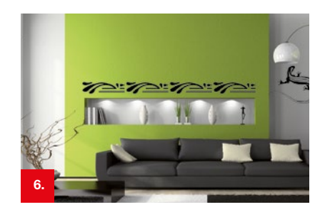
Example 6 ORACAL® 638