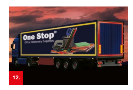
Example 12 ORACAL® 5600E