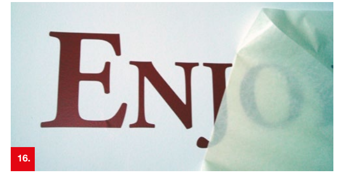
Example 16 ORATAPE® LT52