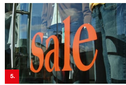
Example 5 ORACAL® 641