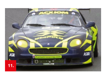
Example 11 ORACAL® 7510