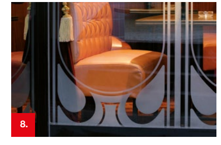
Example 8 ORACAL® 8810