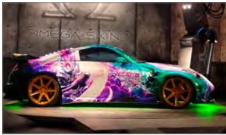
Wrapped by WrapmyRide.nu, Netherlands.