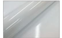
OS-500 White Wonder