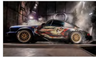
Printed film: OS-501 Pearl of Wisdom Laminate: OS-510 Razor Blade