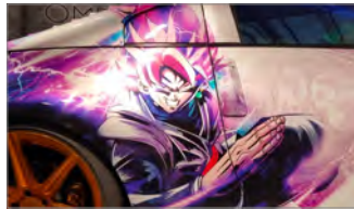
Printed film: OS-501 Pearl of Wisdom Laminate: OS-512 Clearcoat