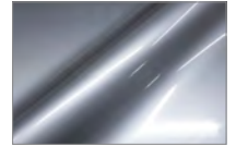
OS-502 Silver Spirit